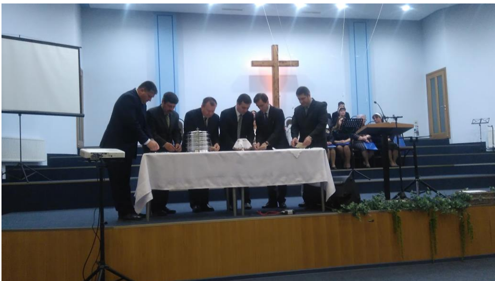
On Maundy Thursday, on April 13 , in the local church of Bethany, as in many other churches on that evening, the Last Supper was observed. The pastor of the church asked me to deliver a sermon during that service.