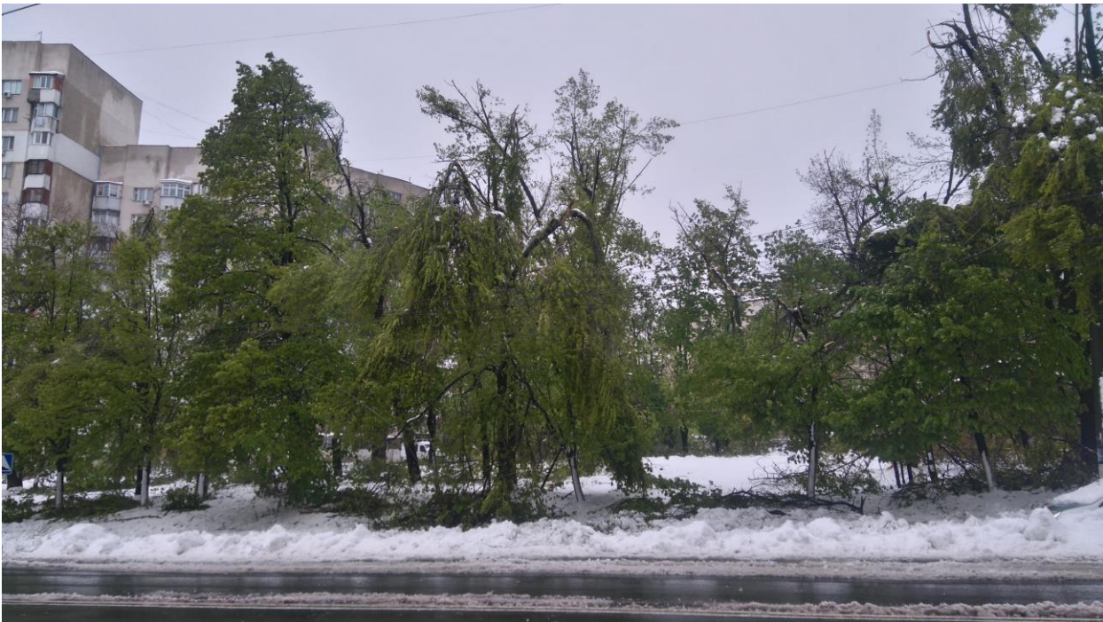
That's how many trees looked sad on April 23, after the storm.