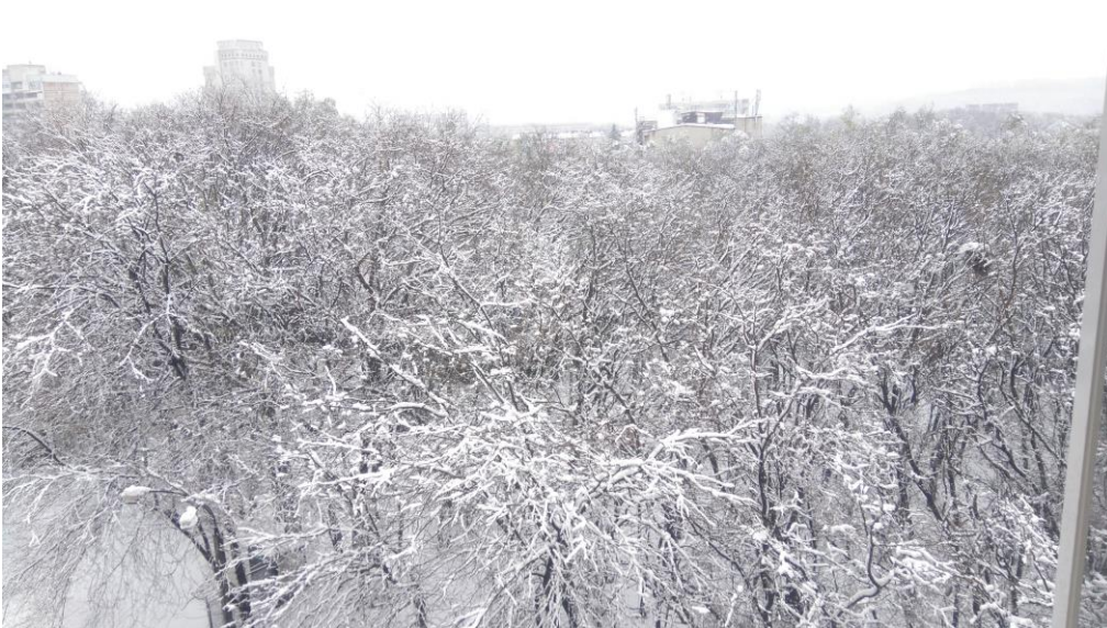
This was the view from our window on the 21st of April.

without electricity for several days. Traffic on the roads became impossible. The city transport did not work. Nina and I did not leave the apartment for two days.